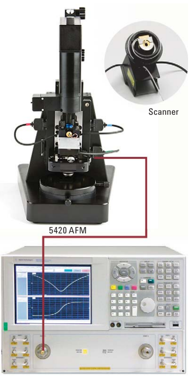
Vector Network Analyzer